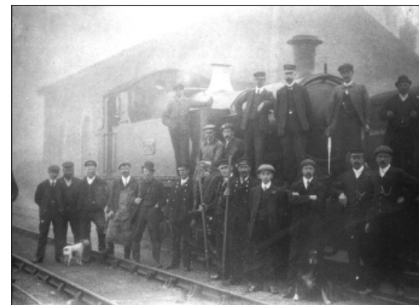
This is an interesting record of 3107 at St Blazey by the small shed which was later demolished. The engine went new to St Blazey shed on 30 April 1906 and judging by the gathering of railwaymen and dogs this photo could well have been taken shortly afterwards.