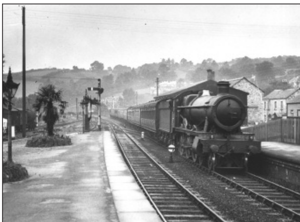
An up express enters Lostwithiel in charge of 4978 'WESTWOOD HALL', which has a very shiny safety valve bonnet, during September 1933. The goods shed is behind the engine.