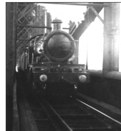
Seen from an unusual vantage point on the Royal Albert Bridge is 4024 'KING JAMES' working the 11am Penzance to Paddington express on 6 April 1919.